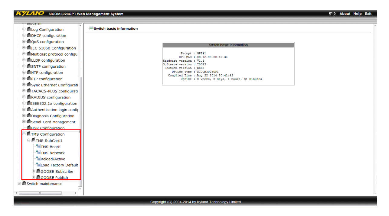
Figure 3 The Navigation Tree of TMS Configuration

4. TMS configuration consists of six parts, including TMS board, TMS network, GOOSE subscribe, GOOSE publish, load factory default and Reload/Active, as shown in Figure 3.