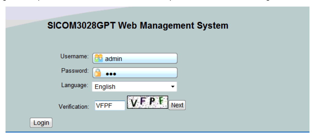
Figure 1 Web Login

1. Input "192.168.0.2" in the browser address bar. The login interface is displayed, as shown in Figure 1. Input the default user name "admin", password "123", click <Login>.